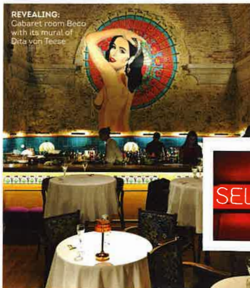
REVEALING: Cabaret room Beco with its mural of Dita von Teese

It's complete with a stage and a mural of burlesque star Dita von Teese — and there's a two-week waiting list.