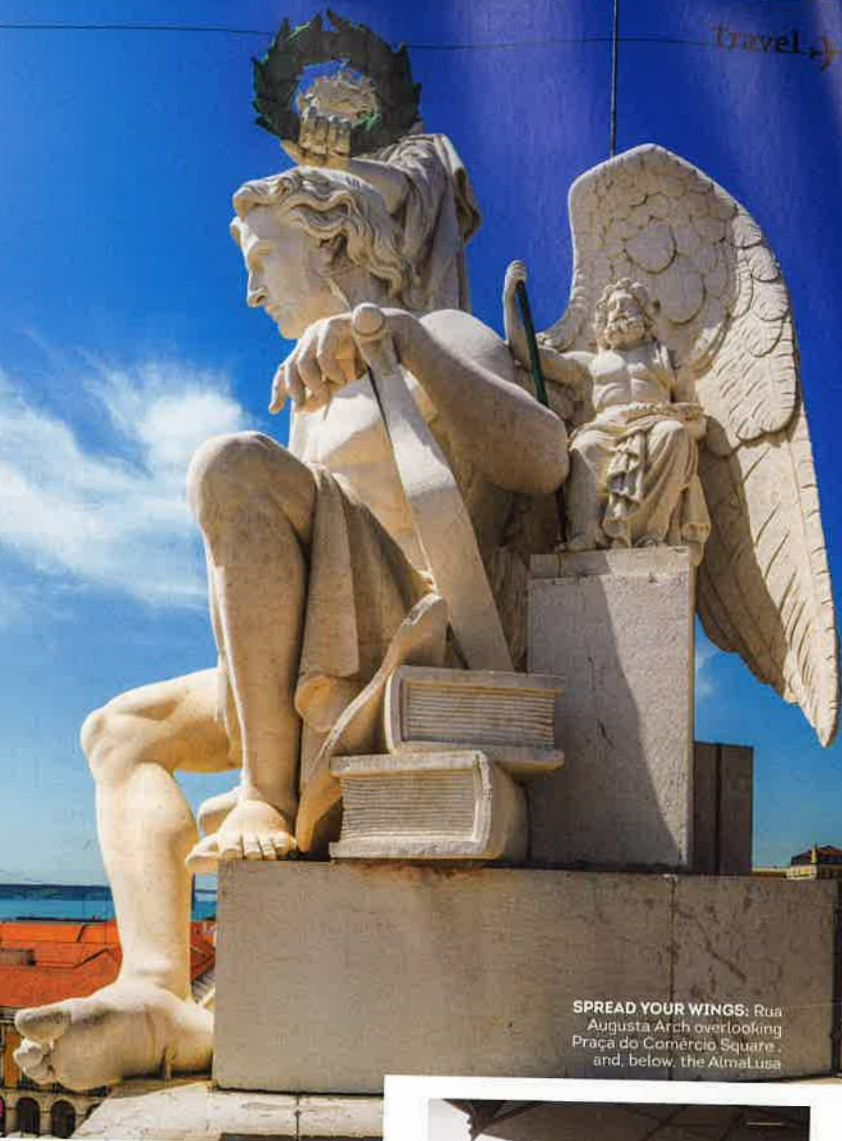
SPREAD YOUR WINGS: Rua Augusta Arch overlooking Praça do Comércio Square – and, below, the AlmaLusa