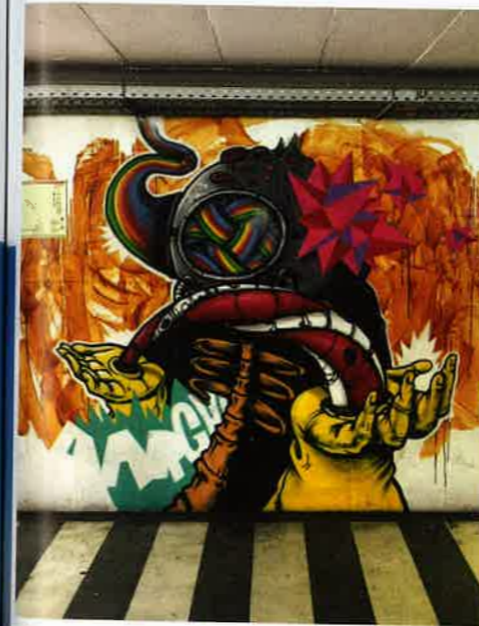
DOWN TO A FINE ART: Not happy with just murals, Lisbon also gives trams a paint job

In between courses, we're ushered through a door for a sneak peak of hidden cabaret dining room Beco.